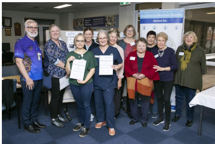
Edith Cowan Award recipients and KEMH Alumni members July 6 th 2023