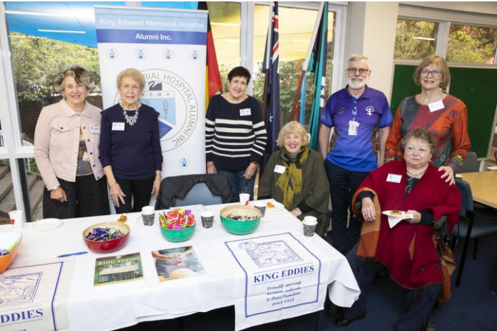
Alumni Members at King Eddies Day 6 th July 2023

Please feel free to bring along a friend who may enjoy this social event